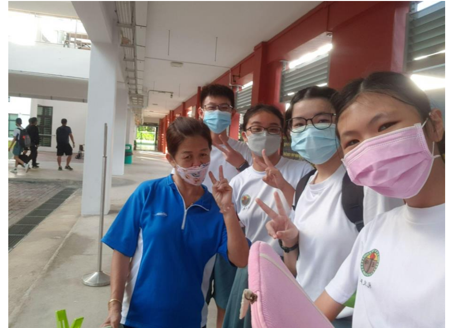
Entry for Our School Our Story photography (OSOS) competition 2022

“During my time in AVA Club, I have learnt many things, such as how to take a photo, edit a video and run a school programme. I would never have picked up all these skills if I did not join AVA Club. I have become more responsible because I would need to show up every morning to set up the microphones for morning assembly and to manage my time better. I also found the CCA's session quite enjoyable as I have made new friends and experiences along the way, where every event posed unique challenges and problems for me to solve. All in all, I find my CCA experience enjoyable and educational.”