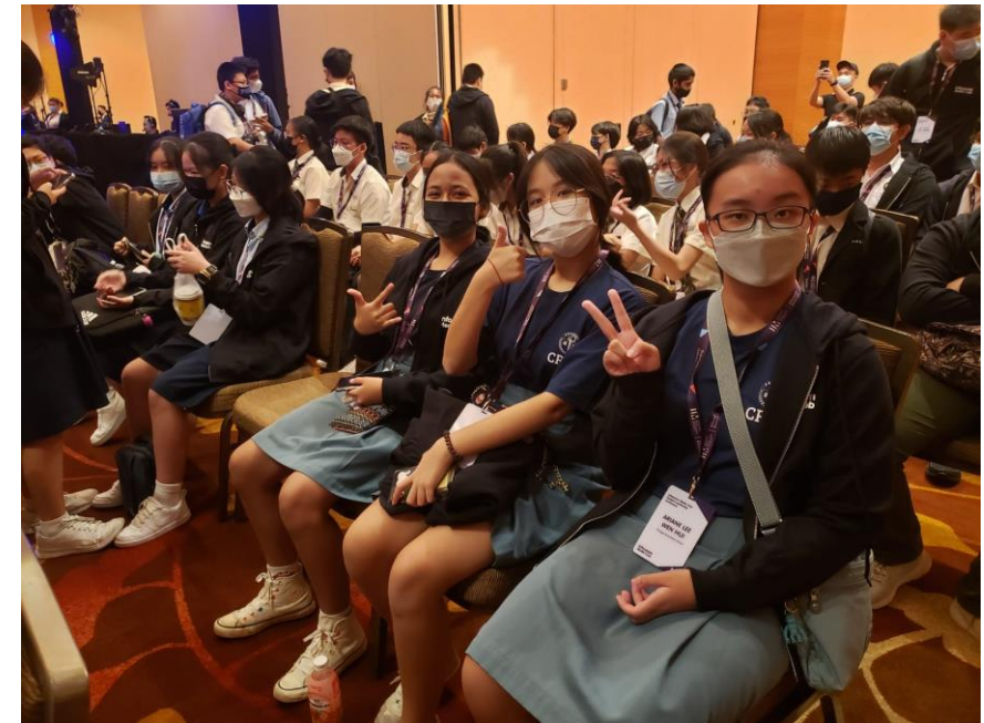
Attending the Infocomm Media Club Student Leadership Conference organised by IMDA

“Being in AVA Club since Secondary One has been an excellent experience. I have learnt audio and video technology skills, made new friends with similar interests, and have taken up this leadership opportunity. The CCA has taught me more about how to work with others, as I can’t lead a whole CCA or do all the audio and visuals for a school event on my own or without communicating with my teammates. Being a CCA Leader has made me feel more confident as I know that my teachers believe that I can lead the CCA. Although I sometimes feel a bit of pressure from it, other leaders are there to help me and I am thankful for their support.”